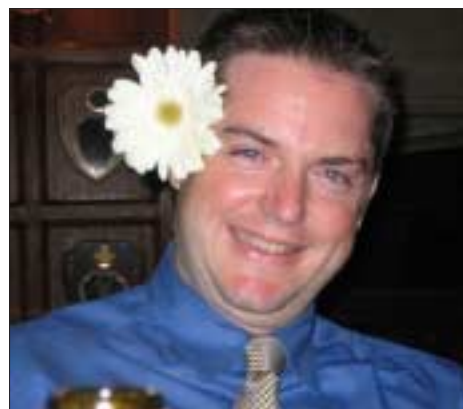
The blossoming of yet another future GALA member...