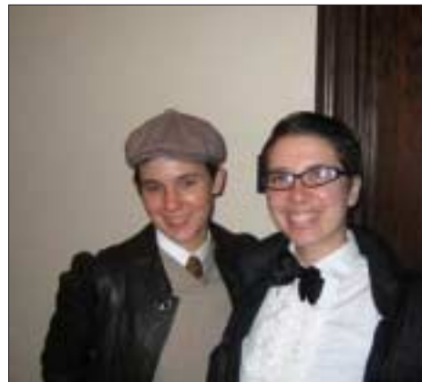
"Couples R Us."